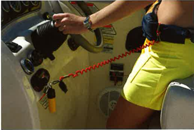
Hooked from the ignition to your life jacket, waist, wrist or thigh, this lanyard shuts off the engine and stops the boat if the operator is thrown overboard.

An ' Emergency Engine Cutoff Switch ', sometimes referred to as a 'Kill Switch', is a time-proven safety device used to shut down the boat's engines and stop the propellers when it is activated.